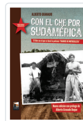
CON EL CHE POR SUDAMERICA GRANADO, ALBERTO