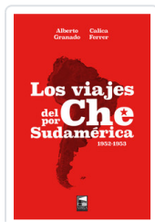
VIAJES DEL CHE POR SUDAMERICA, LOS FERRER, CALICA